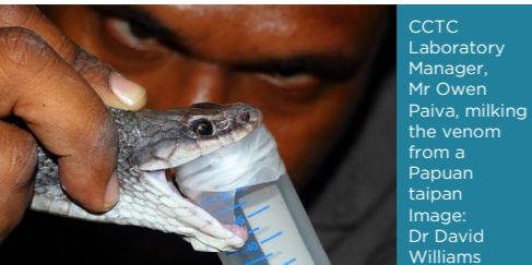
For more than 100 years, the primary treatment for snakebite has been the administration of antivenoms. Good-quality antivenoms can literally make the difference between life and death. However, due to variability among snake venoms (both within and between species), there is currently no universal snake antivenom.