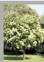
Mannitol (C6 H14 O6, MW 182) is a naturally occurring sugar alcohol found in most vegetables and the sap of the manna ash tree ( Fraxinus ornus ). It resists absorption at high relative humidity, and is a stable substance commonly used as a filler or bulking agent in capsules and tablets.

The team also proposed that mannitol had the potential to be used as a treatment to enhance the clearance of mucus from the lungs of patients with asthma, bronchiectasis and cystic fibrosis. A patent was registered in 1995 and the team published a number of key journal articles in 1997.