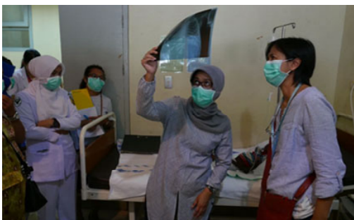
Locally-led TB training in Papua, Indonesia

The World Health Organization (WHO) End TB Strategy focuses on the early detection of TB, the detection of drug-resistant TB and the systematic screening for TB among high-risk groups. It also includes a focus on research and innovation, particularly with respect to the detection and treatment of latent TB infection.